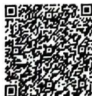
Registrar Pharmacy Council